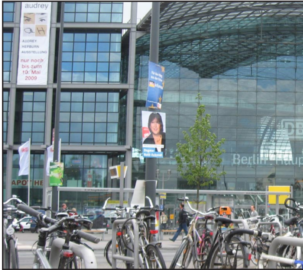
Bike parking in front of Berlin's main station.

The benefits of the $921 million (U.S.) project are significant. Travel time has been reduced on almost every rail line, with some routes saving as much as 40 minutes. At the same time, travelers' options have been increased. The new train routes have 13 percent more stop options than the previous system. The open and attractive space, clean and well-kept facilities, and a variety of amenities have increased comfort for travelers and visitors.