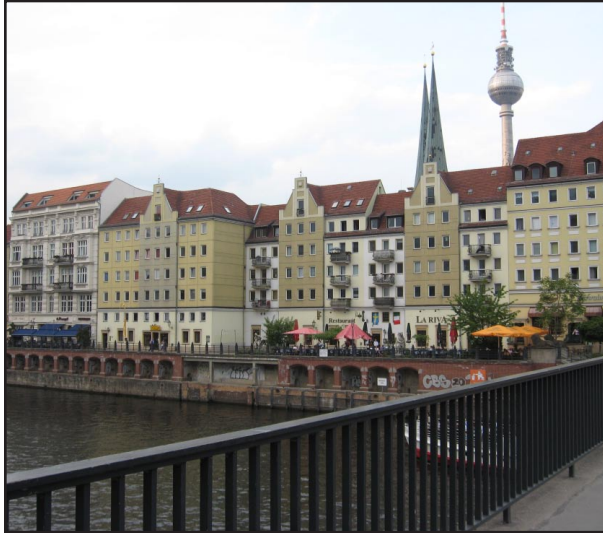
Berlin is an innovator in transit and related housing and environmental strategies.

The Peer Exchange delegation followed up its trip to Stockholm with a four-day visit to Berlin, Germany, in June 2009. Berlin is another global city that has had significant success with transit practices such as congestion pricing and Bus Rapid Transit (BRT), and related housing, transportation and environmental innovation.