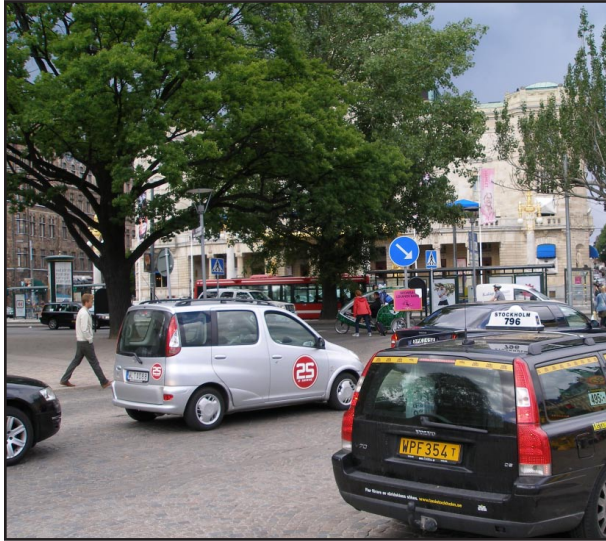
Shared street in city center of Stockholm.

of the 100,000 users who left the roads headed to transit, which boasted an increase of 40,000 passengers per day after 2006.