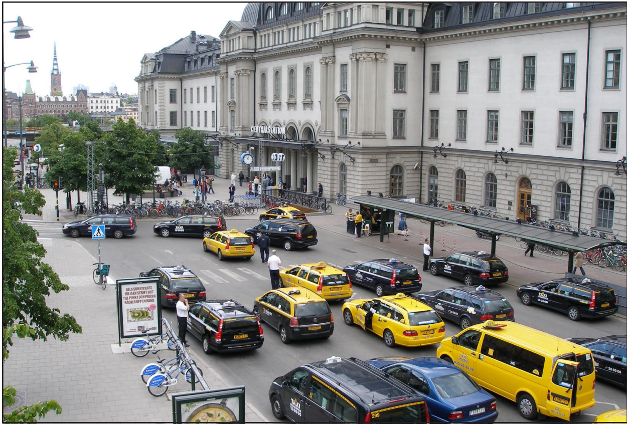
Traffic in the city center of Stockholm.