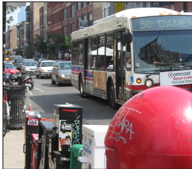
A Chicago Transit Authority bus.

Predictability and reliability have enabled Berlin's VBB to attract and maintain high ridership along its bus network – particularly in locations with multiple connections. The City of Chicago is working on an implementation plan to incorporate some of these tools as part of an Urban Circulator, by upgrading existing technology (such as the bus tracker service) at selected bus stops throughout the Loop.