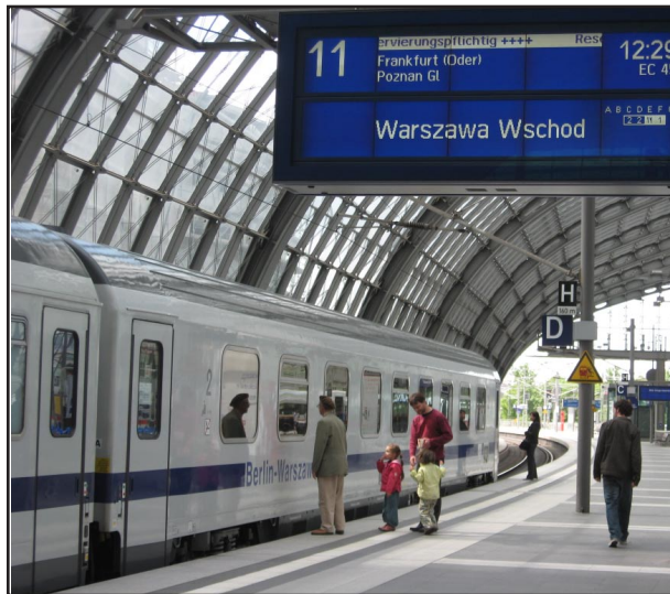
Intercity Express in Berlin.