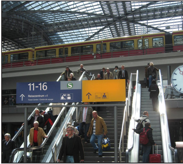
Berlin's main station.