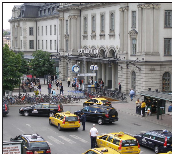
Stockholm's main train station.

In recent decades, Stockholm has received numerous awards recognizing it as one of the greenest, most livable and technologically advanced cities in Europe and the world.