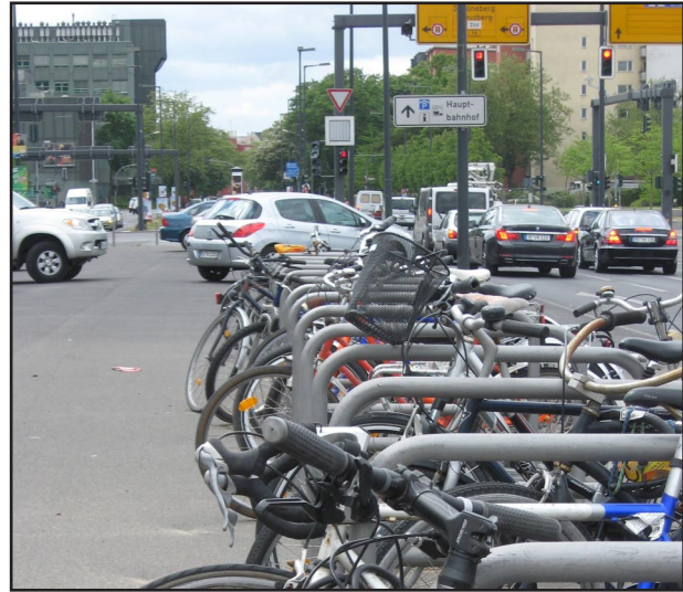
Bike rack in Berlin.

Cyclists in Berlin can travel on 385 miles of designated bike lanes, 62 miles of pedestrian/bike paths, and 31 miles of sidewalk bike lanes; they also have access to 44 miles of bus lanes. At the end of their