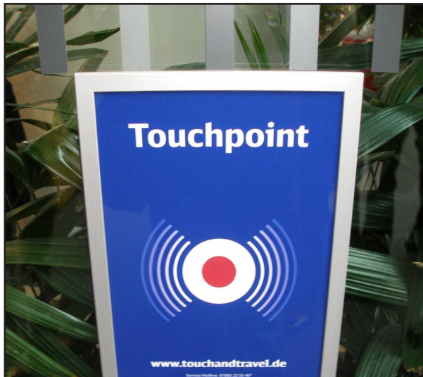
VBB pilot cell phone transit payment system in Berlin's main station.

tool for service providers to encourage transit use. The Regional Transportation Authority (RTA) has recently discussed the modernization of the fare card system on Metra, and has been studying the possibilities of a universal fare card that would be accepted by all three service providers. These are necessary tools to help maximize the effective movement of people throughout the region.