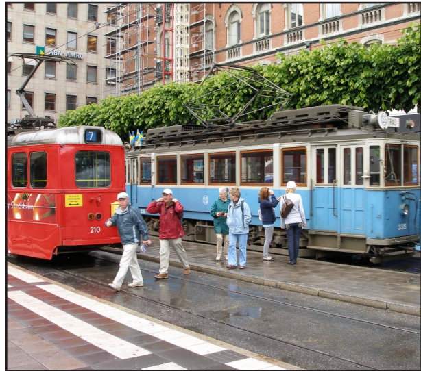
Old-style trolleys in Stockholm.