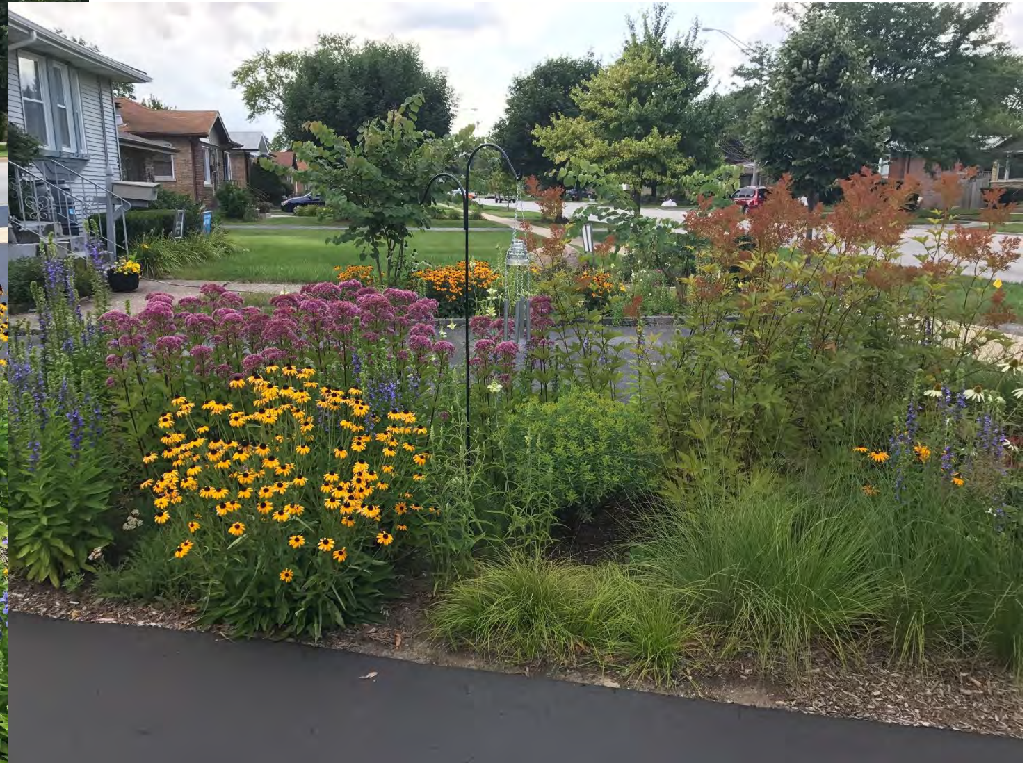
Midlothian residential rain garden on 147 th ST.