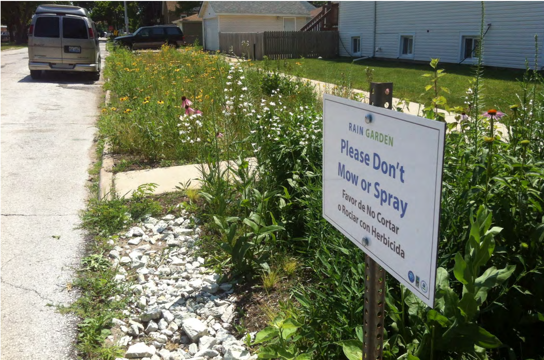
June, 2016 – after one year ... Penstemon, Coreopsis, Liatris and Echinacea blooming.