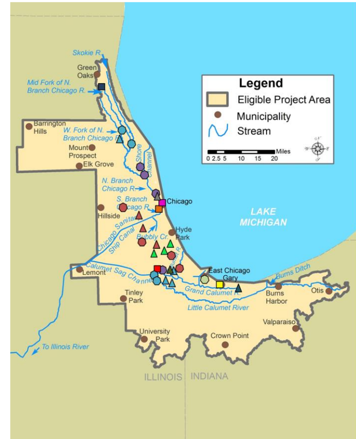
Locations of projects funded 2013–2015