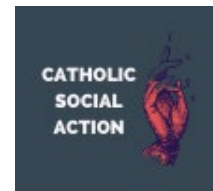
Catholic Social Action Pittsburgh, PA