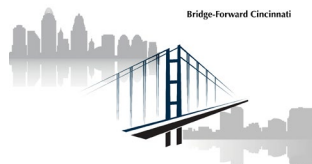
Bridge Forward Cincinnati Cincinnati, OH