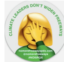
No More Freeways Portland, OR