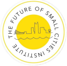
The Future of Small Cities Institute Troy, NY