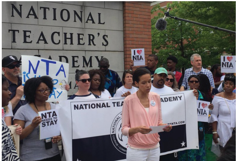
The Chicago Lawyers' Committee for Civil Rights