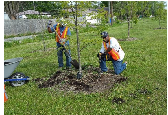
OAI/ High Bridge