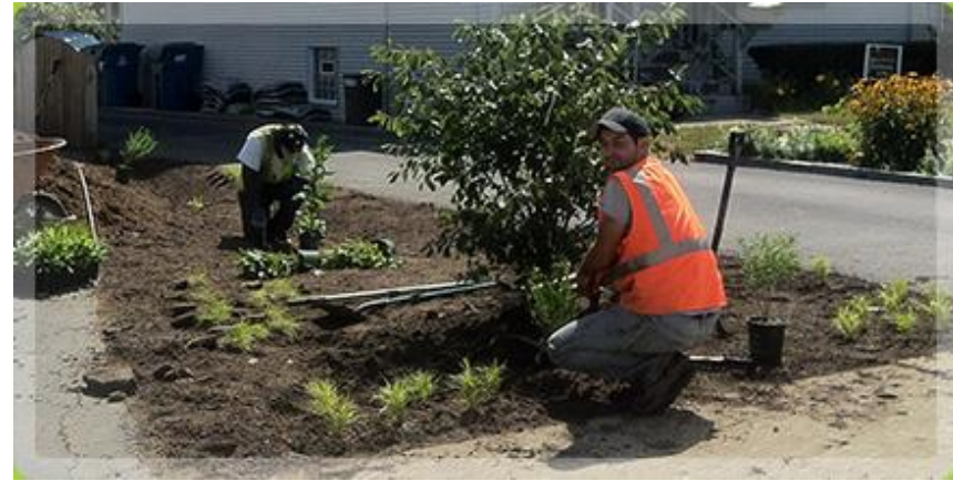
OAI / High Bridge