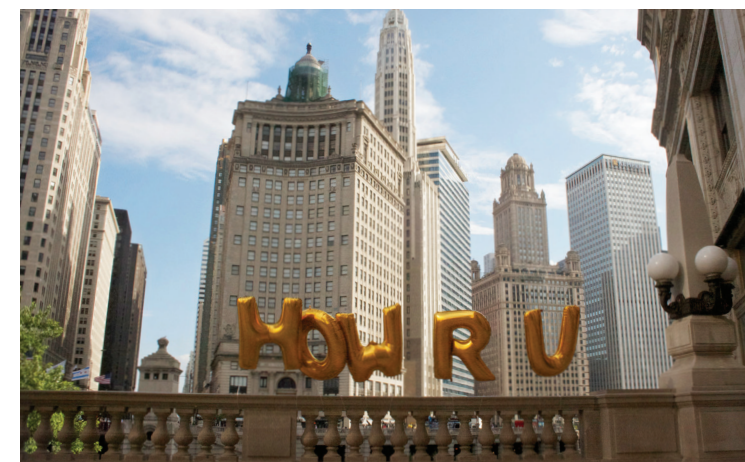
Above: Installation sketch of Wits to Work