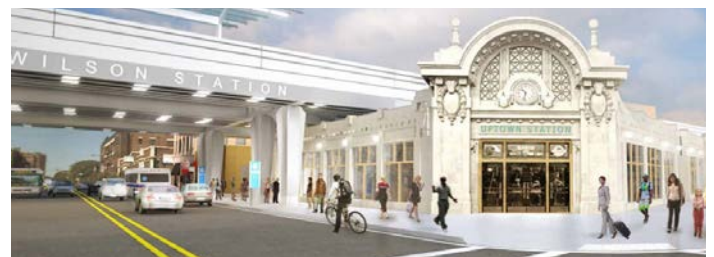
Gerber Building and north side of Wilson Avenue.