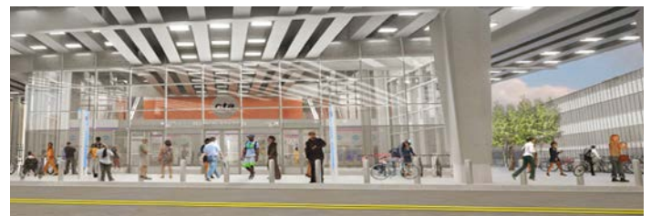
Primary station entrance, south side of Wilson Avenue.