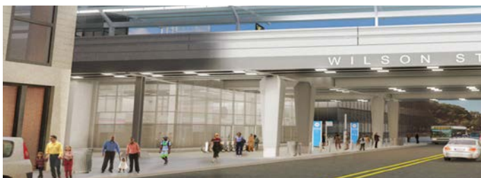
South side of Wilson Avenue.