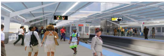
Platform view. Cross-platform Red/Purple Line transfers.